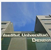
Institut Dexeus (BARCELONA)