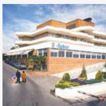
Hospital Ruber Internacional (MADRID)

Cigna puts at your disposal one of the most prestigious and extensive medical service networks, with more than 44,000 specialist and 1,900 hospitals and private clinics in Spain.