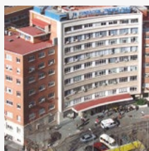
Fundación Jiménez Díaz (MADRID)