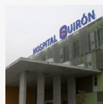
Hospital Quirón (MADRID)