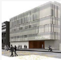
Clínica Corachán (BARCELONA)