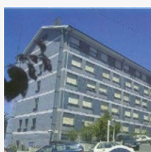
Clínica Virgen Blanca (BILBAO)