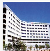
Hospital 9 de Octubre (VALENCIA)

For more details, consult the Medical Network in our website: