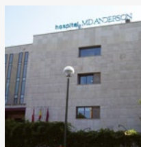
Hospital MD Anderson (MADRID)