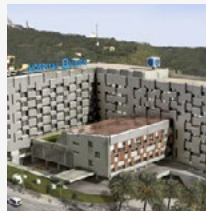
Hospital Quirón (BARCELONA)