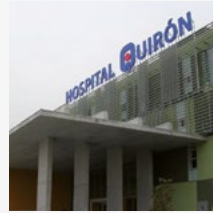
Hospital Quirón (MADRID)