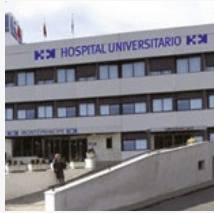
Hospital Madrid Montepríncipe (MADRID)

Cigna puts at your disposal one of the most prestigious and extensive medical service networks, with more than 44,000 professionals and 1,900 hospitals and private clinics in Spain.