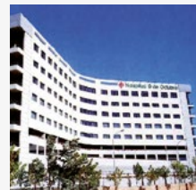
Hospital 9 de Octubre (VALENCIA)