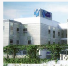
Hospital Viamed Santa Ángela de la Cruz (SEVILLA)

For more details, consult the Medical Network in our website: