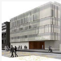
Clínica Corachán (BARCELONA)