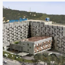
Hospital Quirón (BARCELONA)