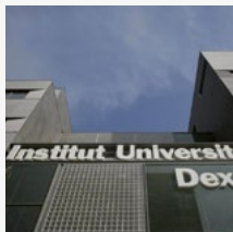
Institut Dexeus (BARCELONA)